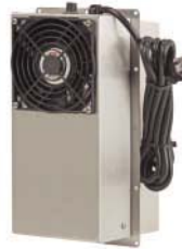
400 BTU (AC)