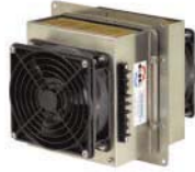
400 BTU (DC)