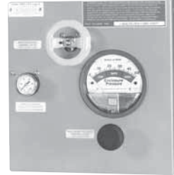
LPS Style (Less Pressure Switch)