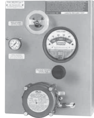
WPS/WPSA Style (With Pressure Switch)