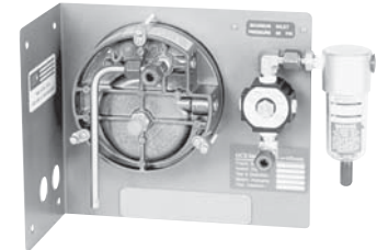
Model ILFK-4 SHOWN IN "OUTBOARD" POSITION